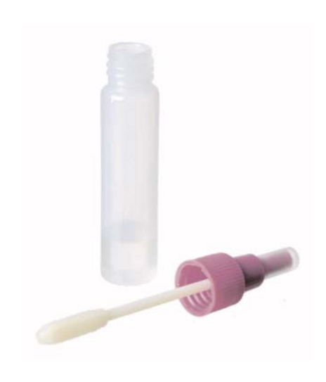
The Draeger SSK 5000: for easy, fast, and safe surface sampling, storage and transportation.

Once transferred into the buffer solution using the Draeger SSK 5000, the surface sample or unknown substance can be stored and transported safely in the sample container. A special screw cap enables the sample container to be converted into a dropping bottle. The sample solution can then be separated or reduced for subsequent analysis using droplet dosing techniques.