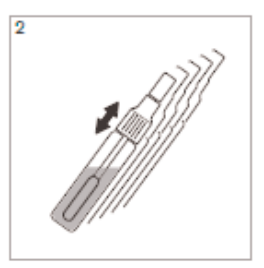
Insert the swab into the SSK 5000 buffer tube, seal and shake for approx. 30 seconds.