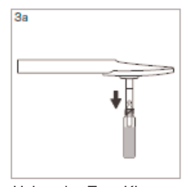
Using the Test Kit cassette: Open the tube and insert the cassette, upside down into the tube. Turn the cassette right side up and wait until the sample indicator has turned blue.